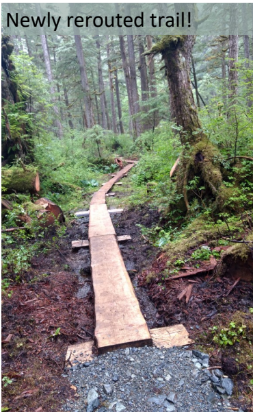
Newly rerouted trail!