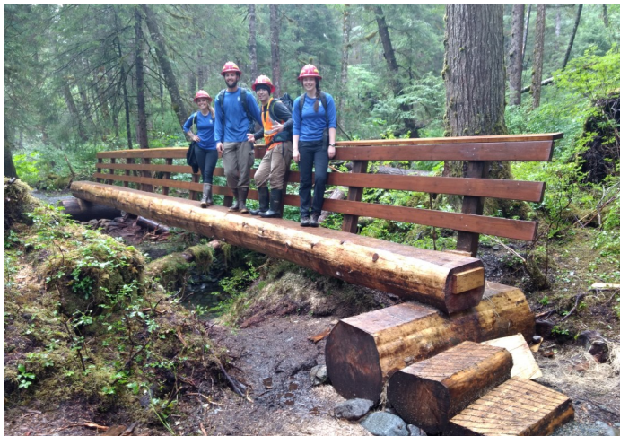
A work crew installing a new log-stringer bridge.