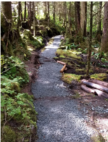
Failing boardwalk replaced by this new gravel section.

Major repairs to Indian River Trail were made this summer using Title II Secure Rural Schools RAC funds. The Forest Service hired the Juneau Trail Mix crew for 3 weeks in June. Their work repaired the first 1.5 miles of trail and improved safety in areas where boardwalk was failing. The Sitka Ranger District trail crew spent 5 weeks working on a 1500' reroute at the last river crossing and installing two new log-stringer bridges. The USFS Sitka Ranger District has secured an additional $80,000 to continue work on the Indian River Trail. They will be working with Juneau Trail Mix to perform a substantial amount of trail work over the next couple of years. Thank you Forest Service for the wonderful effort on this highly-used community trail.