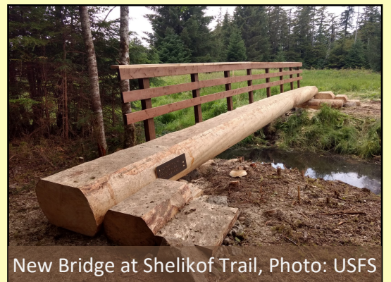
New Bridge at Shelikof Trail

worn boardwalk and stairs and adding gravel. Thank you to our partner, the USFS, for excellent improvements to one of Sitka's most popular trails!