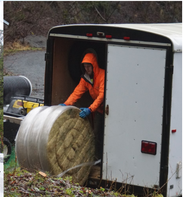
Above: Dump truck delivers rocks in Dec. 2019 Right: Trail crew member Tyler Case unloads wattles for storm water control