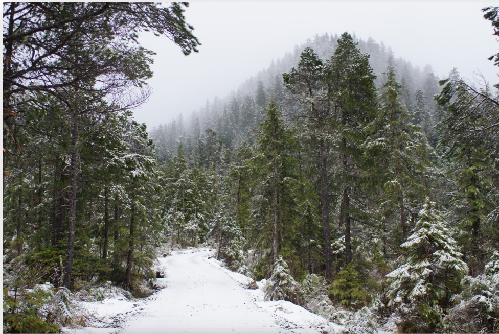
A March 2020 photo of a new portion of Cross Trail currently under construction near the Old Sitka boat launch parking lot.

Construction of the 2.6-mile trail is now in its sixth month with several breaks due to snow or wind. Sitka has experienced an inordinate amount of rainfall December through February, topping 38.44 inches. The good thing about the rainy weather is that it helps us to evaluate and properly size drainage structures.