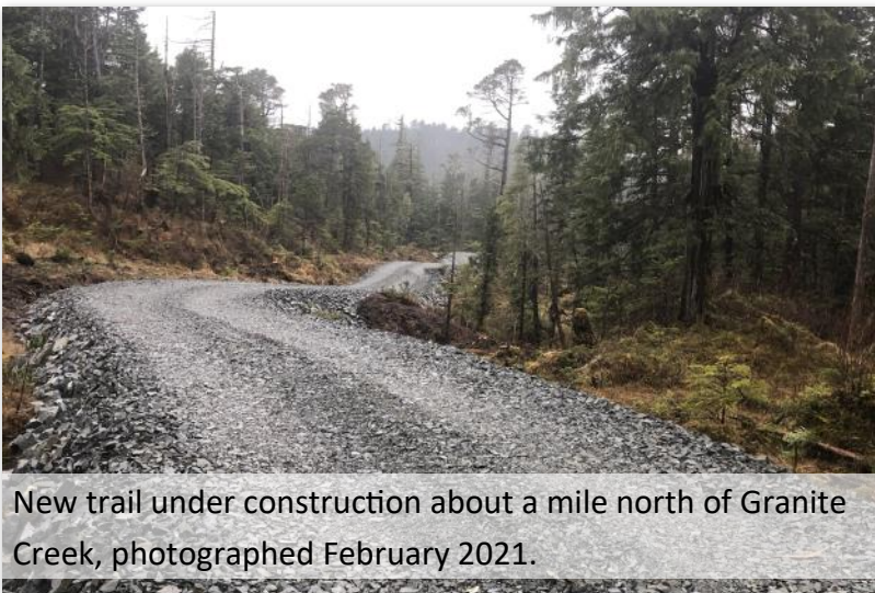
New trail under construction about a mile north of Granite Creek, photographed February 2021.

With the crew's tenacious effort through less-than-ideal conditions, the Cross Trail advances! Despite a seven week break due to snow and frozen ground, we've constructed 70% of the 2.6 miles from Harbor Mountain Road to Starrigavan. Work on the Starrigavan side is complete to Watlachéix'k'i Héen (No Name Creek) and the main line from the other direction is less than a quarter mile away.