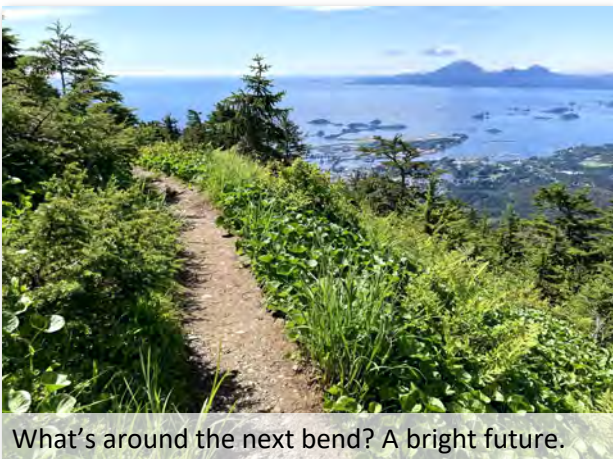
What's around the next bend? A bright future.

Do we need better walking paths between neighborhoods? A destination backpacking route? What does Sitka need to thrive economically and socially? We want to hear from you.