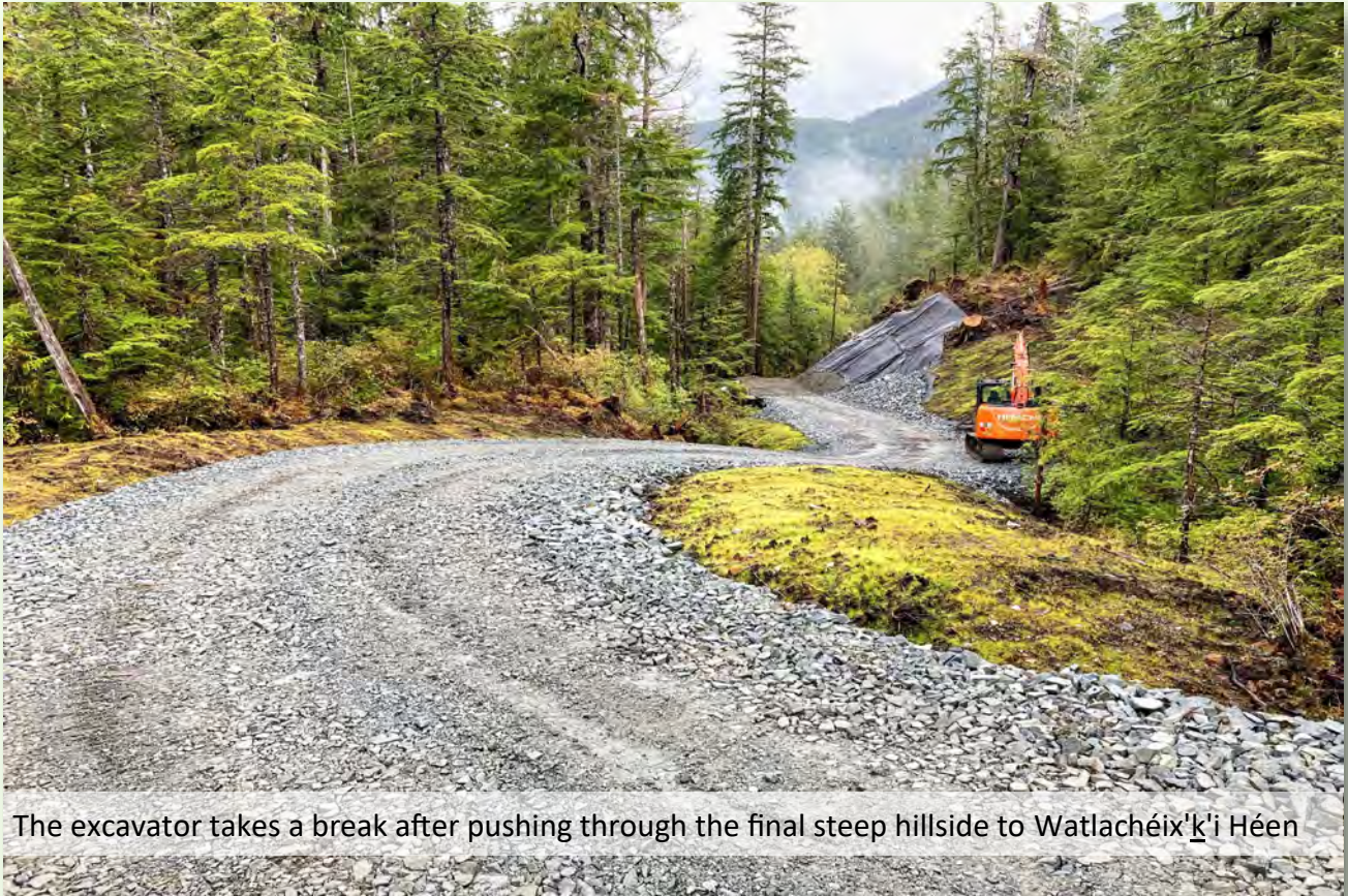
The excavator takes a break after pushing through the final steep hillside to Watlachéix'k'i Héen

We appreciate your patience in staying off the trail during construction, as the crew is actively falling trees and running heavy machinery. Thanks for all your support in getting us this far!