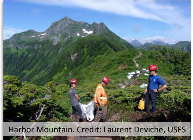
Harbor Mountain.

Out on Kruzof Island, the Forest Service team tackled some much needed improvements to the Shelikof Trail. Many of the gaping mud holes that have threatened to swallow hikers between Iris Meadows and the beach have been subdued by hours of gravel hauling. With the bridge and reroute completed in 2019, hikers can now pass through the intertidal Meadows at most tides. The crew plans to finish the battle against the remaining mud holes next season.